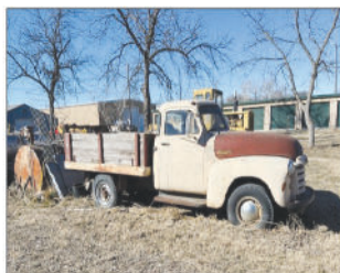
1953 Chevy Pickup

1959 DJ2 Jeep 2 wheel drive 1953 5 window Chevy pickup 1952 1 1/2 ton Studebaker Truck w/ hydraulic hoist